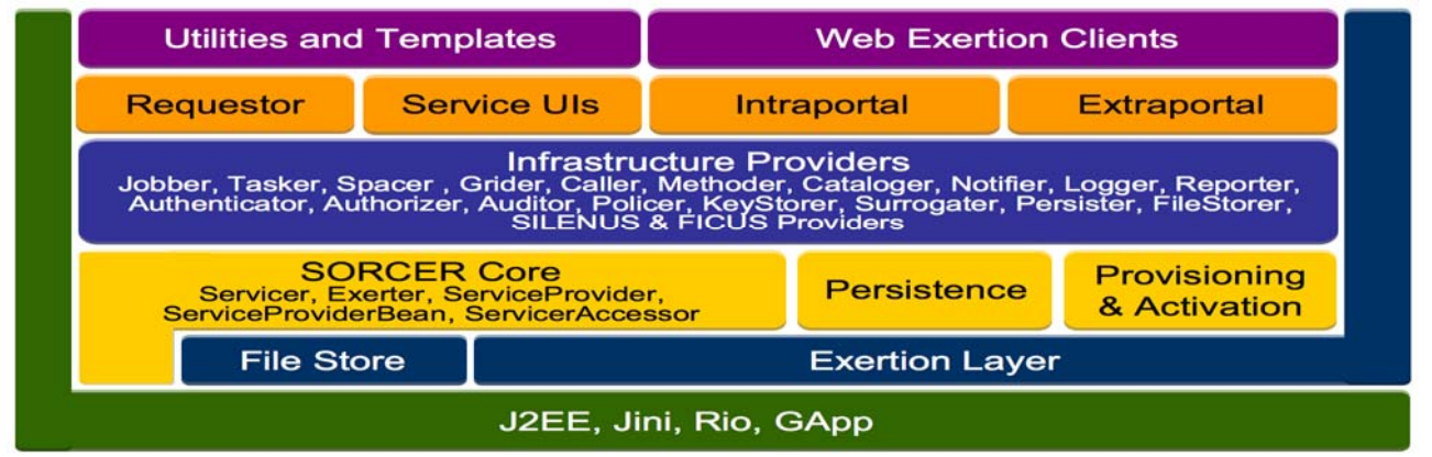
Figure 1. The SORCER layered functional architecture.

Domain specific servicers within the federation, or task peers ( taskers ), execute task exertions. Rendezvous